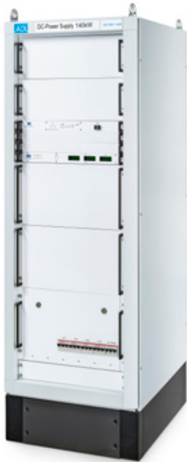
Cabinet – front view