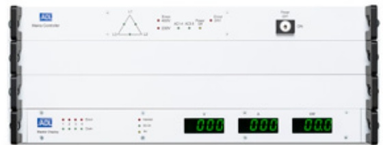
Mains Controller MC 8 (top) and Master Display MD 4 (bottom)

For non-reactive processes, the HX 900 – HX 1400 are highly reliable and economical power supplies. The modular construction gives customers a flexible configuration for different applications and requirements. The very fast arc handling detects important process parameters automatically and adapts to changing situations instantly. No user interaction or programming is necessary, which simplifies initial operation and conversion for different targets. Efficient water cooling ensures a long lifespan even in non-air-conditioned environments.