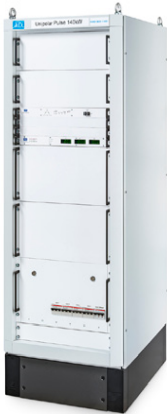
Cabinet - Front view

The HXD 901 – HXD 1401 is a very convenient solution, which combines high power, easy handling and stable processes. The modularly designed unipolar pulse generators are optimized for reactive coating processes for cathodes up to 4 meters in length. The generator recognizes all relevant process parameters fully automatically and adjusts its arc detection and arc erosion independently. To start the operation or to make a target change, no adjustments have to be done by hand. Powerful water cooling guarantees the highest reliability – even in a non-air-conditioned environment.